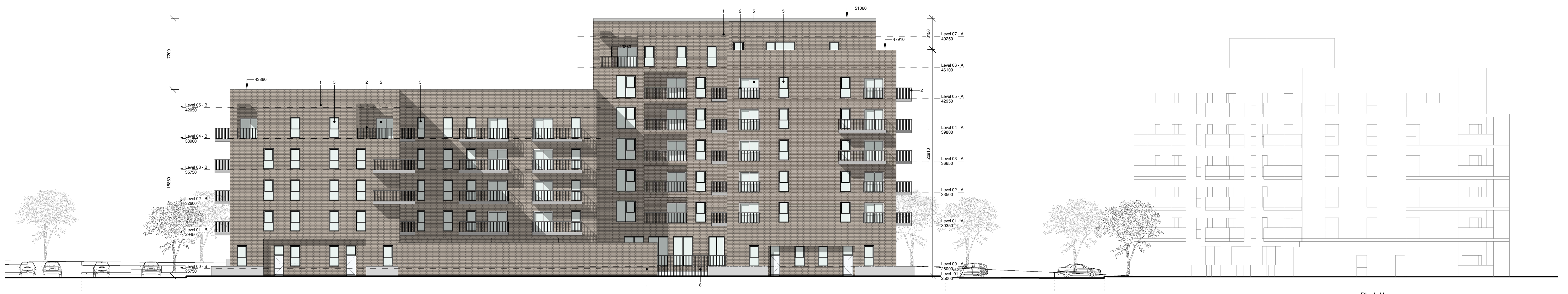
1 Block G - Elevation North 1:200